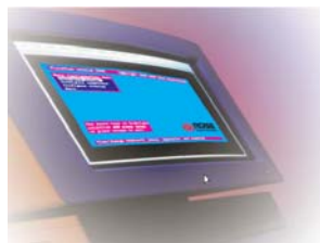
UltraView Pro on-screen menu

With its advanced on-screen menu system, built-in security, flash memory, easy expansion, front panel controls, and other features you start to get a sense of the UltraView Pro advantage.